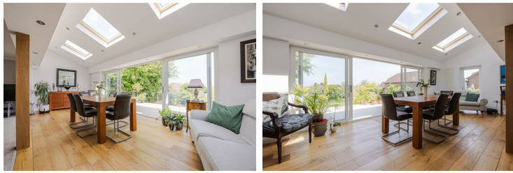
Sun room 24'1" x 7'8" (7.36 x 2.36)