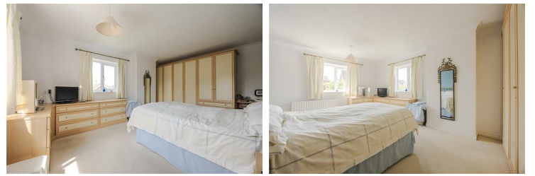
Bedroom one 16'2" x 11'6" (4.94 x 3.53)