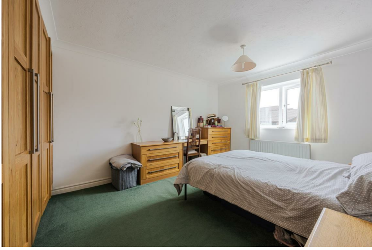
Bedroom two 14'0" x 10'11" (4.29 x 3.33)