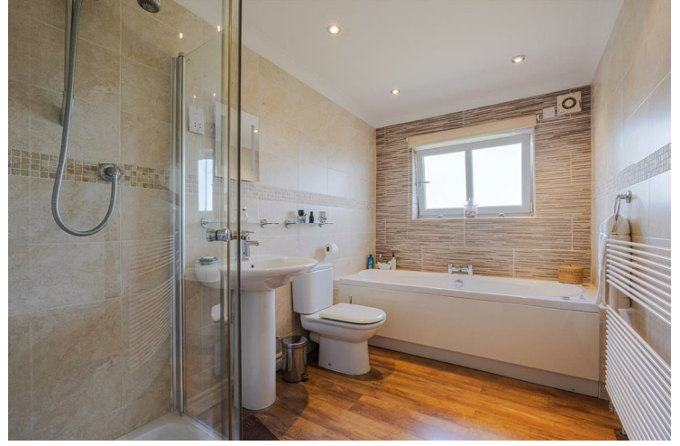
Family bathroom 10'11" x 6'8" (3.33 x 2.05)